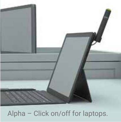
Alpha – Click on/off for laptops.