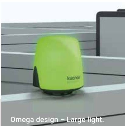
Omega design – Large light.